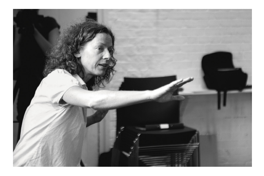
FIGS 3-4 Workshop at Michael Chekhov in the Twenty-First Century: New Pathways Symposium, Goldsmiths, University of London, September 2017