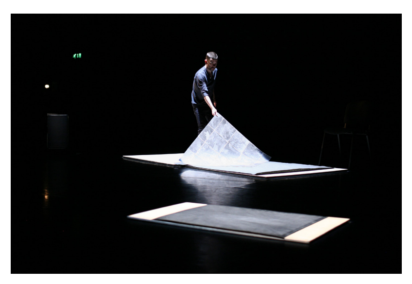
FIG 8 Colin Dunne moving speakers to create different sites of exploration in Concert , Barbican Theatre, London, 17–20 October 2018 FIG 9 Colin Dunne sets up one of his 'stages' in Concert , Barbican Theatre, London, 17–20 October 2018