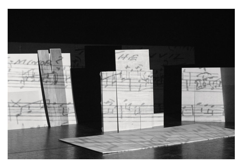
FIG 5 \,\, Scenography research for Concert, Shawbrook, Co. Longford, Ireland, January 2017

FIG 6 Video experimentation in research and development for Concert , Irish World Academy of Music and Dance, Limerick, Ireland, September 2017 FIG 7 Colin Dunne playing The Liffey Banks album in a photo shoot for Concert , Irish World Academy of Music and Dance, Limerick, Ireland, September 2017 →