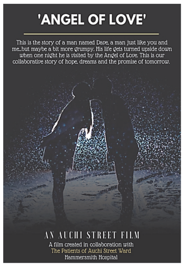
Abstract 7 Figure 5