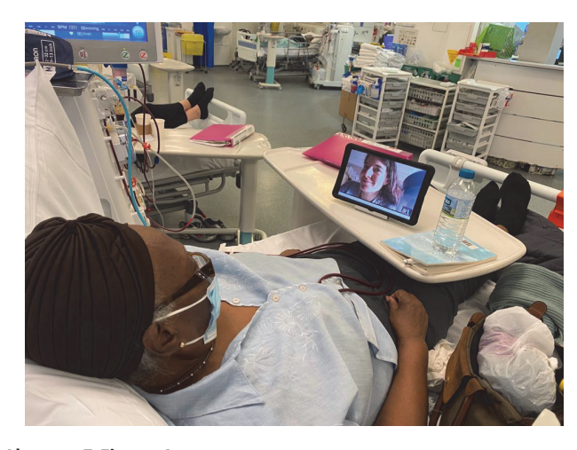
Abstract 7 Figure 4