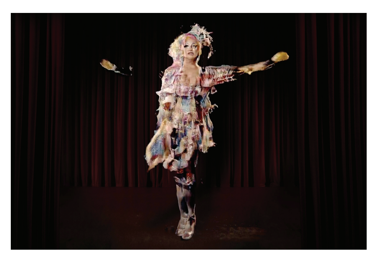
Image 6. Still from The Zizi Show with Zizi performing as an amalgam of all the deepfake drag performers.