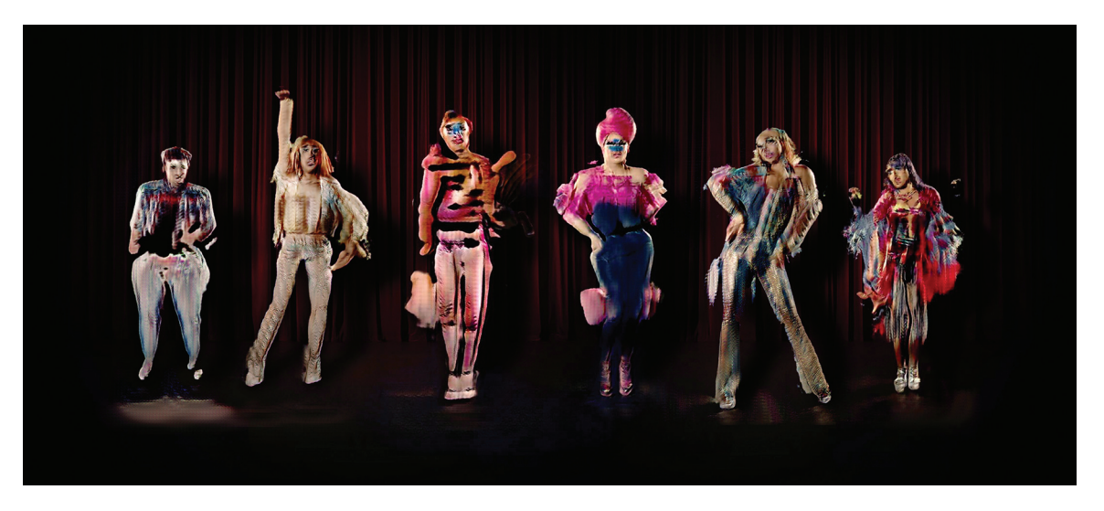
Image 7. Promotional image for The Zizi Show , showing a combination of different drag performers across six deepfake bodies.

the deepfake drag performers. The performers all came from a crosssection of the drag performance scene in London and were chosen as broadly representative of the different identities and performance forms on the scene.