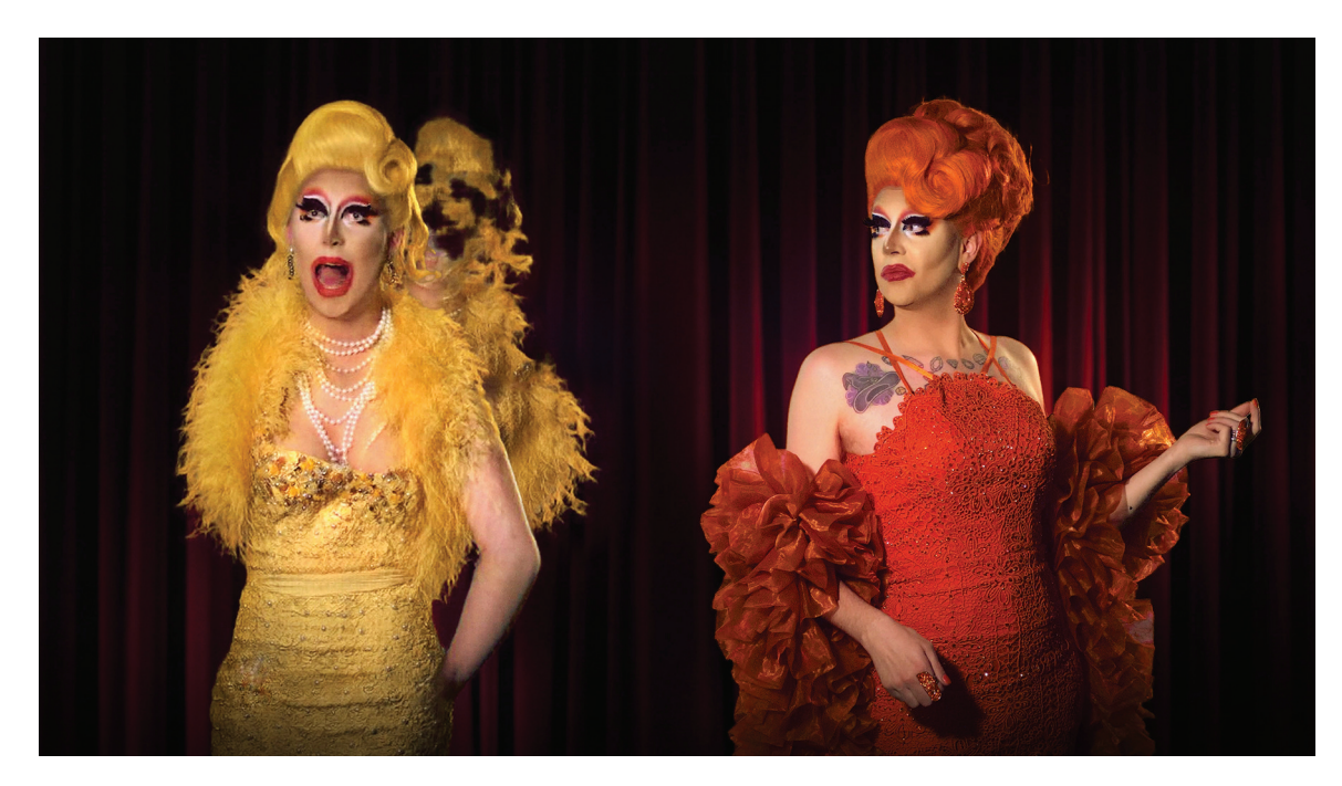
Image 3. Video still from Zizi & Me. Left: Zizi, Right: Me The Drag Queen.

references to specific drag performers and performance forms, there are also these monstrous moments that defy human logics (and, indeed, biology) to speak to the future of drag whilst still being connected to drag histories and presents. Ultimately, whilst body-less, the images created refer back to drag bodies that queered the normative dataset used to generate the work and simultaneously make utopian gestures towards technological and embodied forms which move beyond binarized recognitions of gender and drag forms.