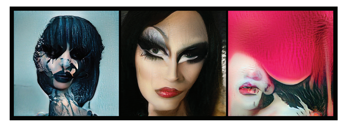
Image 1. 3 different manifestations of Zizi in Queering the Dataset.

AI and Machine Learning surround our existence in both insidious and obvious ways, from voice-activated home assistants including Siri, Alexa, and Google Home to algorithms that determine what content and advertisements we see on social media. AI and Machine Learning systems are able to engage with vast amounts of data at unprecedented speeds. AI systems learn through processes simultaneously similar and different to human learning. One example of these systems, Generative Adversarial Networks (or GANs), can produce deepfakes, where networks generate and manipulate fake imagery of a person almost indistinguishable from reality.<sup>2</sup> Journalist Ian Sample describes deepfakes as '[t]he 21st century's answer to Photoshopping, [they] use a form of artificial intelligence called deep learning to make images of fake events,