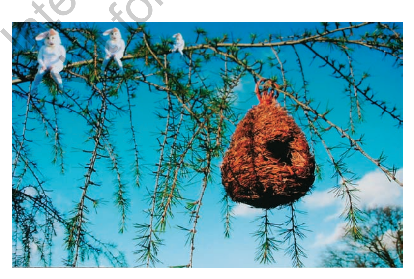
Figure 1: An advertising flyer for Nest.

A starting point in the three-year project with Briscoe had been the uncertain general knowledge that the school had been built on the site of a former farm, and I became interested in the possibility of what could be learnt from 'overlaying' a farming landscape on to that of a school. A key approach was to persistently negotiate spaces that fell outside of conventional learning zones, to up-end how certain spaces were used and transgress expectations. For example, I commissioned Mark Storor to set up as artist-in-residence to operate in the (glass-sided) school hall over a period of a week, attracting people in to the space with an invitation of spectacle and complicity. Reflecting on what we had learnt about the school (in terms of care, damage and conflicts of interest), we decided that he should build a giant nest, using hay from a local farm and with the help of various school inhabitants, throughout the five days. The nest played host to the weekly staff meeting, a parents' workshop and a nursery picnic, and became a place to hide or hang out for those children who struggled to stay in class. Notably, when Mark dismantled and removed the nest, many people expressed a genuine sense of loss and confusion that this