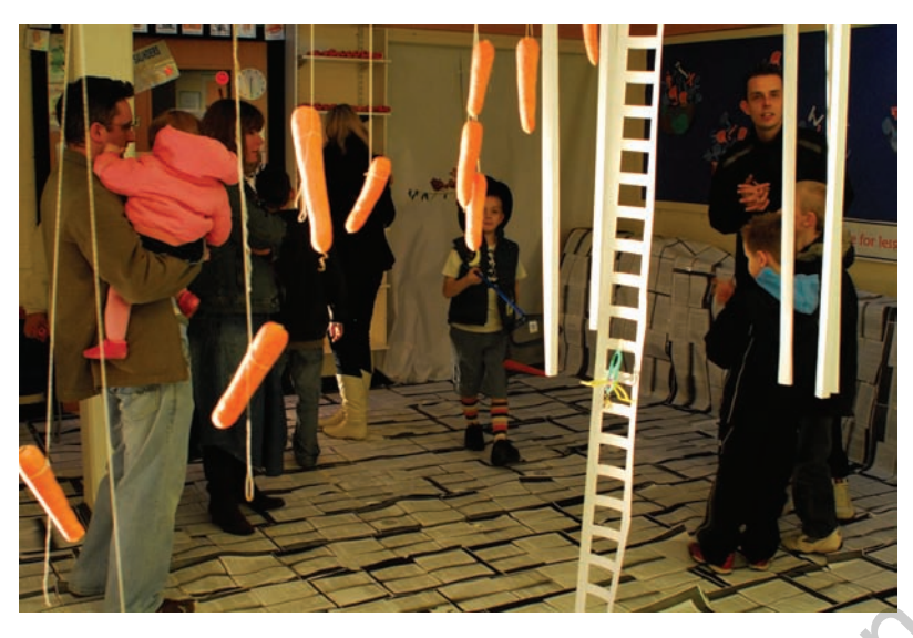
Figure 8: The Aviary (a 'twitcher' takes the audience through a hole into a nest of paper ladders, carrots and words).

Bauman calls these carnival bonds 'bonds without consequences' (2001: 71). The implication is therefore that a carnival community is one that might be experienced lightly, as a carnival would be, rather than a community that is longstanding, fraternal and sharing. The bonds within such a community, Bauman suggests, would be perfunctory. An artist might well be perceived as one who develops only carnival bonds with their participant community because of the brief and fragmentary contact. The 'artist as cuckoo' metaphor implies such transient brevity.