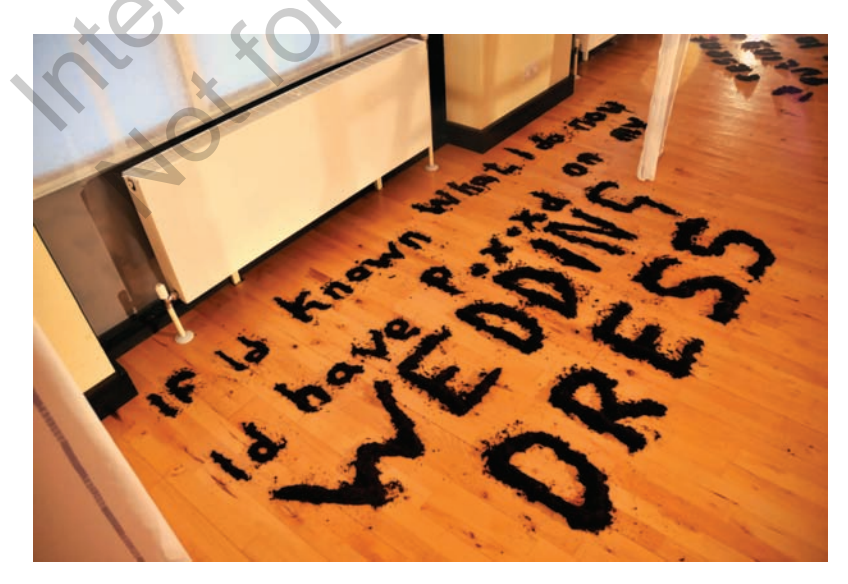
Figure 6: The Airing Cupboard (a mother's words written in soil).

Perhaps this pleasure in anarchic play and freedom was facilitated partly by a temporary inhabitation. Edward Casey suggests that such responses are encouraged by temporary or transient locations: '[A] truly transitional space is often a place for creative action, providing enough protection to encourage experimentation (if not outright exploration) without being overly confining.' (1993: 122) There seemed to be a Bakhtinian licence for ludus and boundlessness in the artistic work at Briscoe, led by the artists – perhaps because of not being tightly and formally part of that place.<sup>2</sup> Such boundlessness appeared to be enhanced by the disrupted temporalities that were thematic of this project: artists entered the project for different lengths of time; people went to school on a Sunday (to see Nest); much of the work took place outside the usual times of learning (in breaks, at lunchtime, after school); pupils sent out of class were immediately incorporated into activities (such as building the nest in the school hall). A luxurious, abundant sense of flexibility and freedom became part of the project's 'excess' - encouraged, perhaps, by temporality: of presence and non-normative time-patterns.