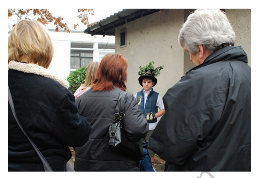
Figure 3: A child 'twitcher' starts the promenade for an audience.