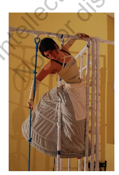
Figure 4: The Airing Cupboard (a mother performs nurturing gymnastics).