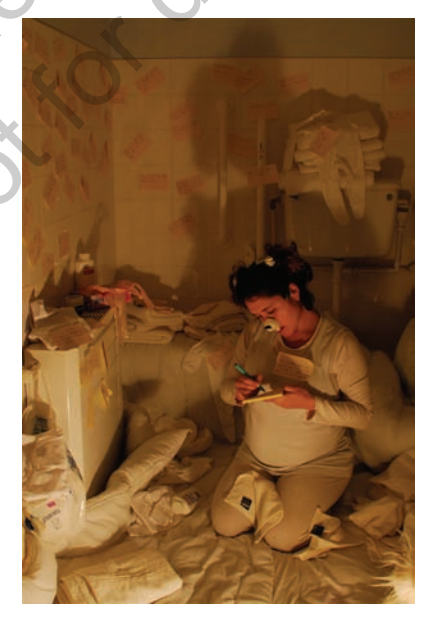
Figure 9: The Mothership (a room of waiting and advice).

The artists were clearly not able to throw off the ethical responsibilities of being part of the community, as Bauman suggests happens with 'carnival bonds'. They gained considerable pleasure from the more 'permanent' residents' achievements and re-engagement with Briscoe; they found the freedom invoked by artistically experimenting with performance in that temporary place deeply rewarding; they were unable to assuage guilt at 'walking away' at the end of the day. These were not the friable bonds that match with an image of the cuckoo as a hardened, careless trickster or simply the provocative migrant; they were not what Bauman might term 'carnival' bonds. These bonds were perhaps short-lived temporally but they were not perfunctory.