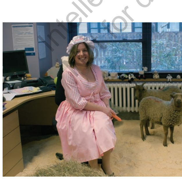
Figure 7: The Fold (a head teacher tends to her sheep).

Nest was a success. Three years on, a clear re-engagement with the 'place' of Briscoe is evident by those who inhabit it, and even by those not actually present during Nest, as identified more fully in the concluding section. Its 'excess' - such as the upturned desks - is retained as somehow iconic of the project. It may be that, when working with disengaged communities on performing place projects, 'excess' is something to be aimed for. An assumption might be made that engaging with place would be to live and operate more firmly and confidently within a place's everyday, to 'accept' its operational norms and acclimatize to these fully. In fact, intensely experiencing places by transgressing their norms through performance-related activities might more constructively facilitate emplacement. While experiencing place cannot be continuously excessive - this would negate 'excess' as a concept, as there would be no 'normative' from which 'excess' departs - moments or periods of heightened effervescence invoked by performance-related activities may well effect a greater engagement with place, as they did in the Nest project.