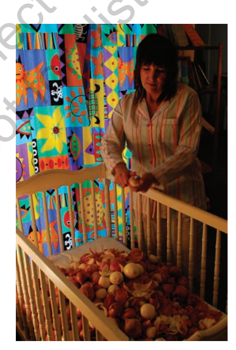
Figure 10: A cot of tears en route to the Nest of Silence.

Second, a performance of place in community contexts can create a shifted, positive perception of that place, resulting from an affective response to situations of 'excess'. I allude to a long history of thought on 'affect', of course – a history that this article can only briefly reference. Nigel Thrift (2008)