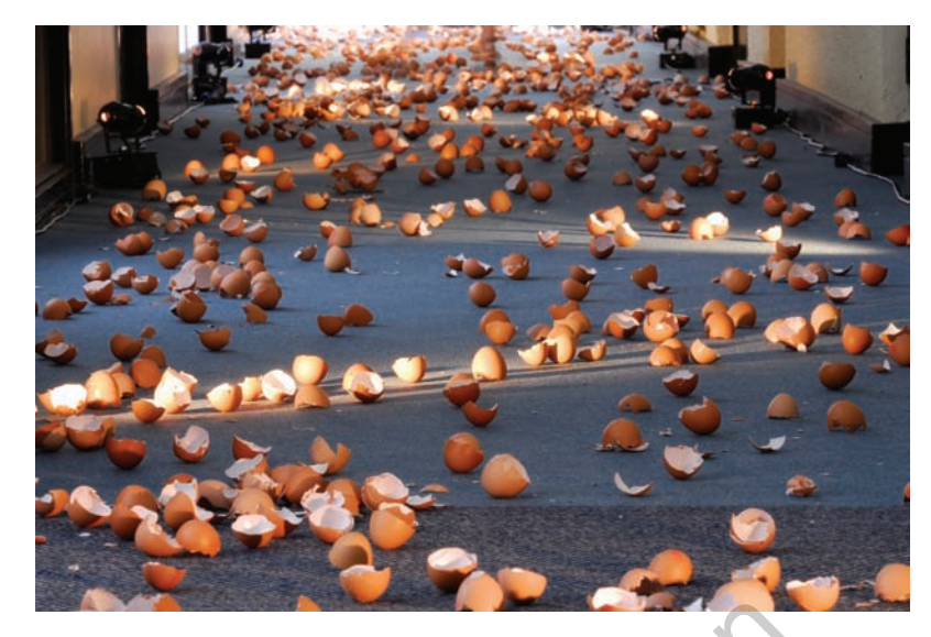
Figure 5: Walking on eggshells.

to some extent security – even if it is inhabited non-permanently. With this interpretation, temporary place becomes more interspersed periods of affective dwelling. Of particular interest to me is the potential role of performance practices in bringing about a changed perception of such places when they are sites of dis-ease.