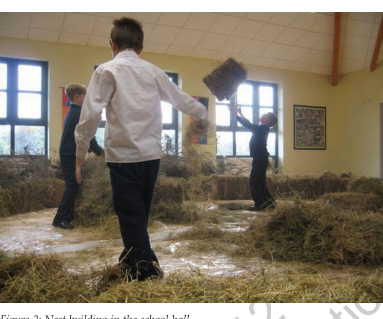
Figure 2: Nest building in the school hall.

place, formerly and once again the hall, was no longer a place of absurdity and sanctuary; it no longer smelled or 'felt right' anymore.