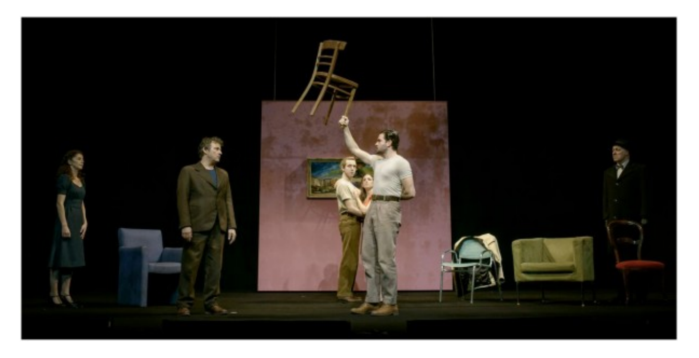
The Upstairs Neighbours by Cesc Gay.

Alejandro Andújar's set offers a kitchen-dining area that smacks of Scandi design; functional shelving with condiments, pots and pans, and drinks, all neatly put away. It's a space that Anna likes to control but its order is gradually eroded as the play progresses. The to-ing and fro-ing of the quartet lends the piece the air of an Ayckbourn or Ray Cooney farce but there's also an element of Yasmina Reza's bitter black comedies and Albee's Who's Afraid of Virginia Woolf ? in the tone of the language and violence that's unleashed during the course of the production. (There are certainly echoes in Arquillué's performance of his battered George in Daniel Veronese's 2012 production of the play.) Carme Pla deploys her elastic features to good use as the vivacious Laura while Jordi Rico's Salva uses the façade of a down-to-earth firefighter to mask a more calculating temperament. Pla and Rico do suffer, however, from having the least interesting of the roles—like Nick and Honey in Who's Afraid of Virginia Woolf ?, they are the catalysts that show the rotten core at the heart of the other couple's marriage. Their revelations and offers put Juli and Anna on the defensive but it is Arquillué and Roca who have the meatier roles.