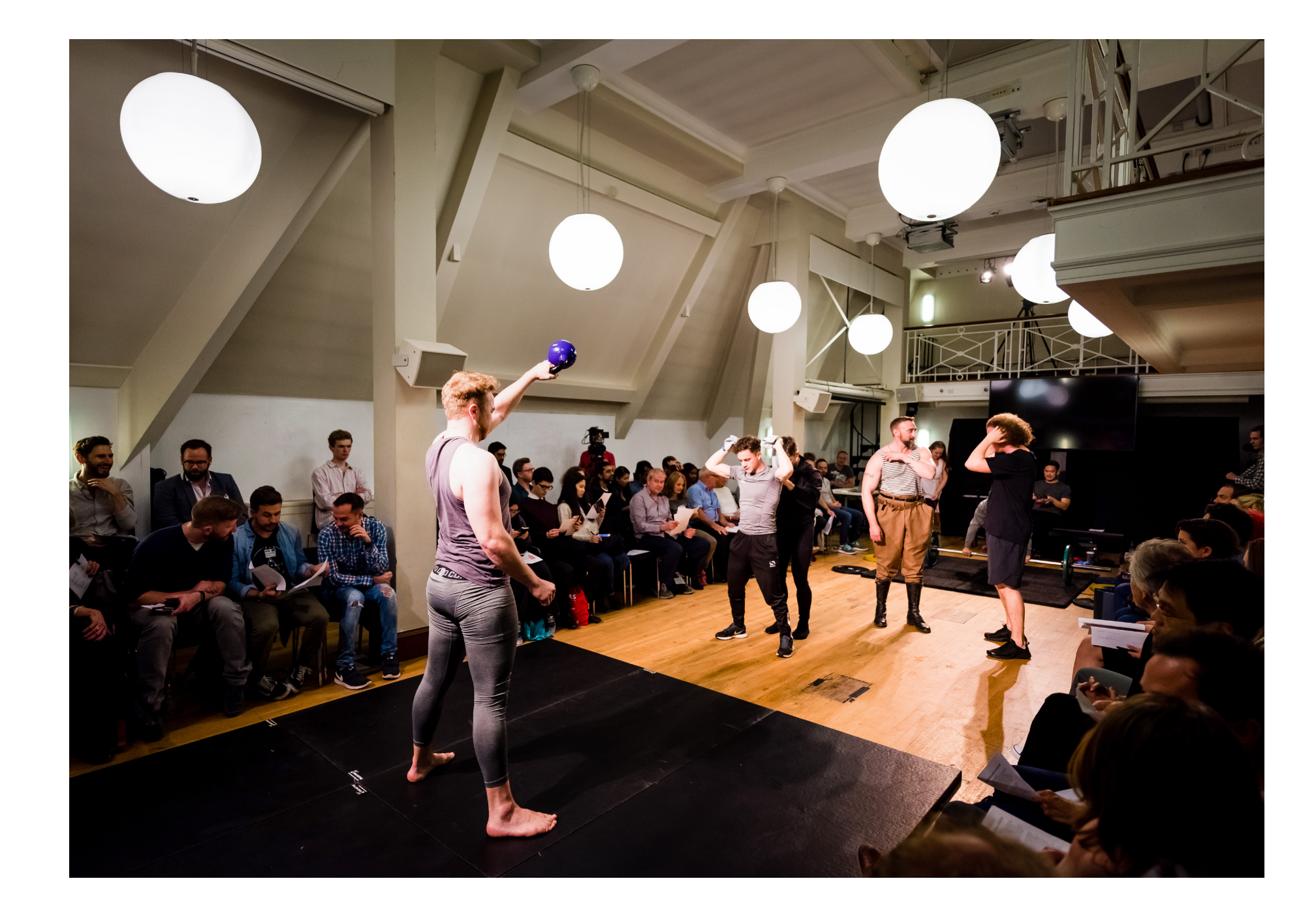
FIG 1 Pre-show photograph during audience entrance, from The Dynamic Tensions Physical Culture Show , performed at the Anatomy Museum, King's College London, 13 October 2017