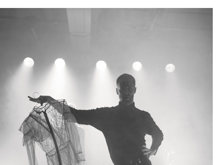
FIG 2 Barry Fitzgerald in And The Rest of Me Floats at the Bush Theatre